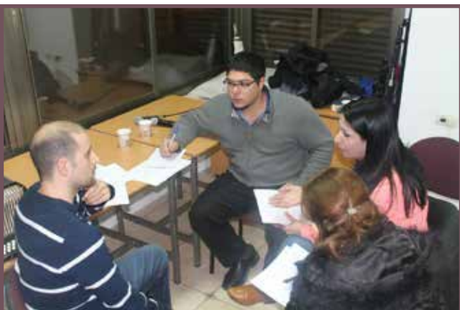
Youth in Jerusalem meet to discuss different challenges: the political, the economic, the social and the spiritual.