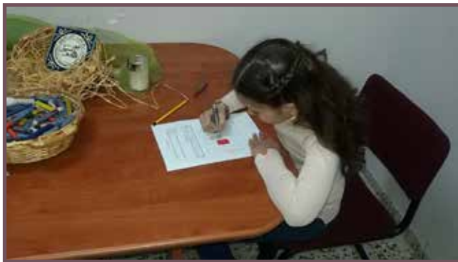
The first meeting of the children's program in Nazareth