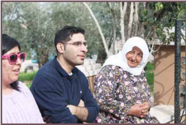
Sabeel youth visit Christian families in isolated villages in the West Bank.