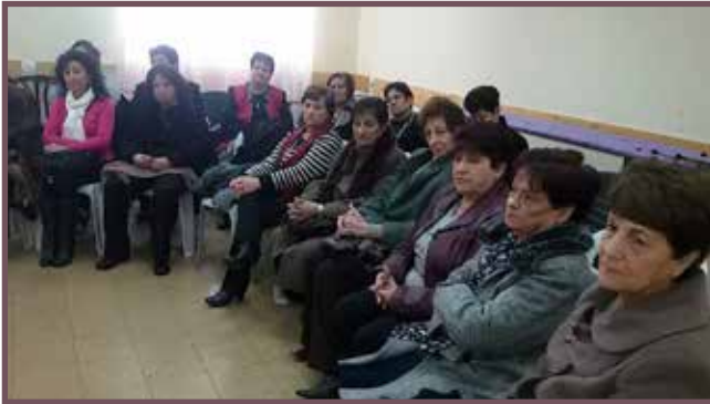
Women's meeting in Nazareth to document the memories of the 1948 Nakba