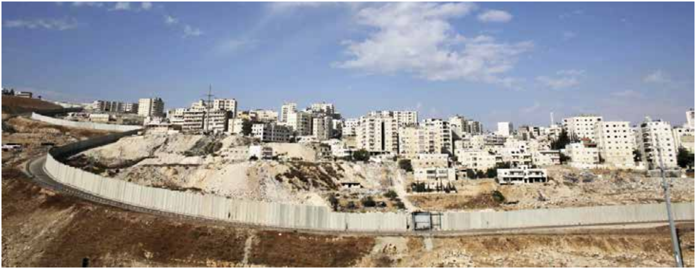
A section of the separation barrier and Shuafat refugee camp in East Jerusalem