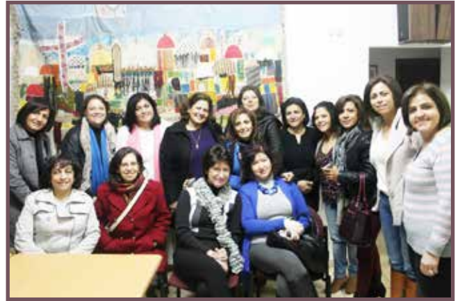
The Sabeel women gather for a brainstorming and discussion session for programs in 2015.