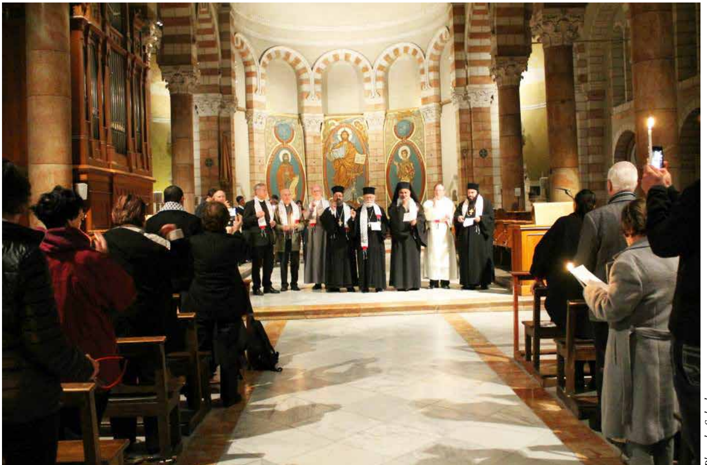
Sabeel's ecumenical prayer service for Jerusalem at the Dominican Church in November 2014