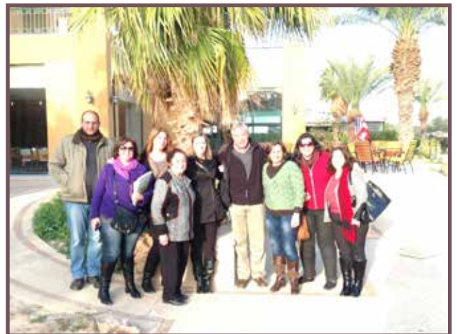
Sabeel Nazareth and Jerusalem staff and volunteers meet for a retreat in Jericho.