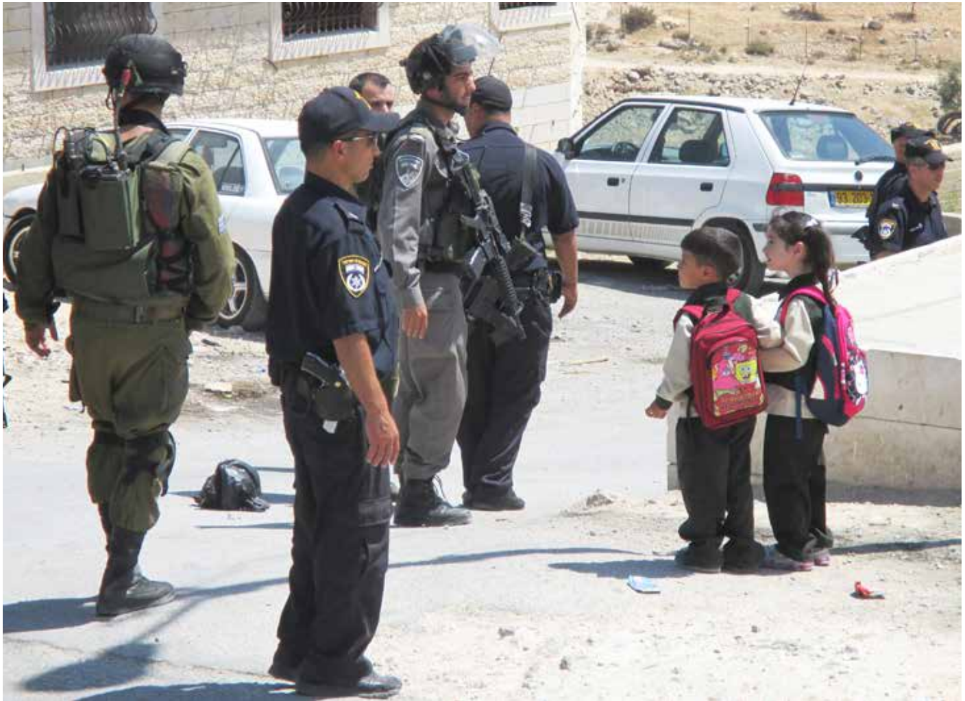
School children in the Silwan neighborhood of East Jerusalem