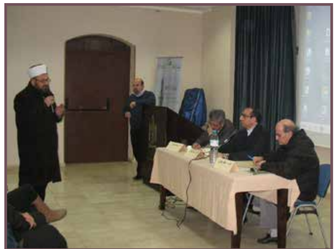
Launch of the book Non-violent Resistance in Islam and Christianity at Bethlehem University