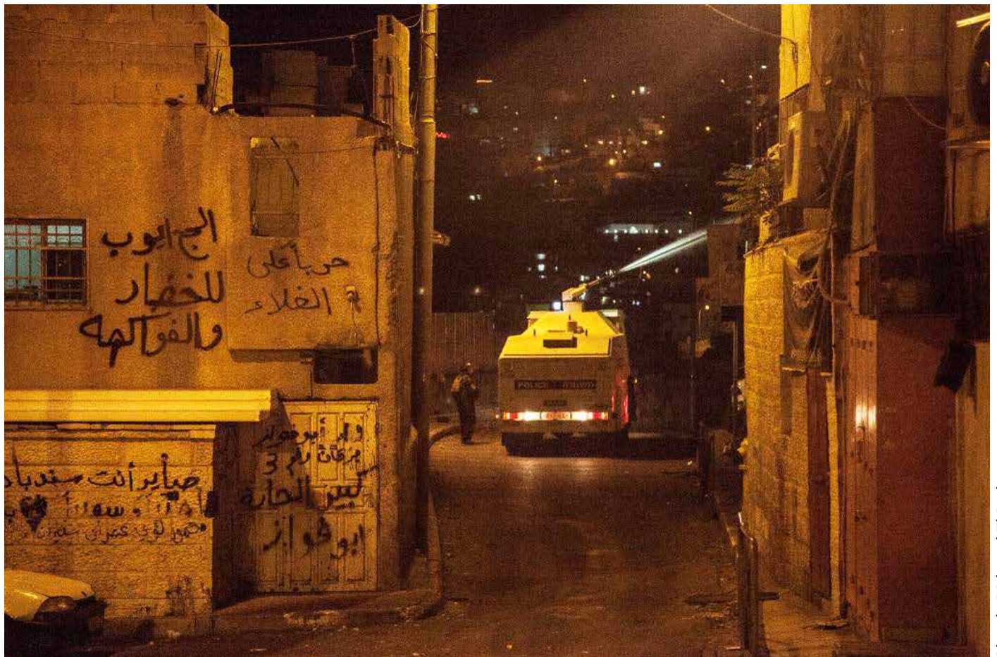
Israeli police spraying Palestinian houses with "skunk water" in East Jerusalem in July 2014.

The fifth plague: The Jewish settlers have lost all control and are trying to take over every spot of land in the city's