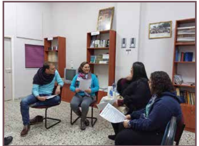
Youth meeting in Nazareth to discuss Pope Francis's new ways of fasting for Lent