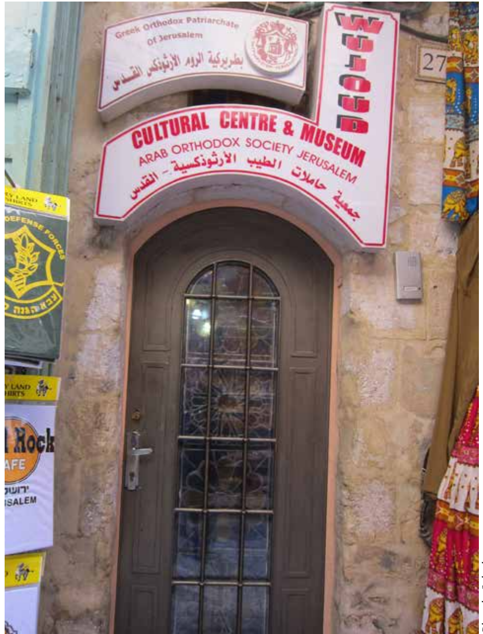
The outside entrance of the WUJOURD museum in the Old City near Jaffa Gate

Despite the small proportion of Christians among the city’s population – due to emigration in search for a better and more secure life and more stability – the Christian presence is physically and humanly prominent in Jerusalem, particularly in the Old City. There are 180 churches in Jerusalem and some 117 Christian institutions and sites. The contribution of the minority Christian population, the “Living Stones,” is quite significant at all levels whether in the educational, cultural, medical or humanitarian assistance realms, and has been vital support to the Palestinians at large.