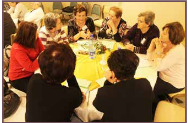
Women from Jerusalem and Nazareth meet in Jericho to discuss "The Role of Women in Church and Society."