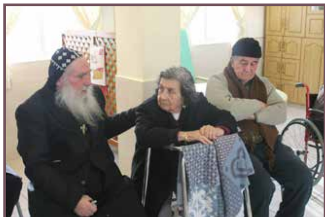
The community visits the elderly at an old age home in Jerusalem during Lent.