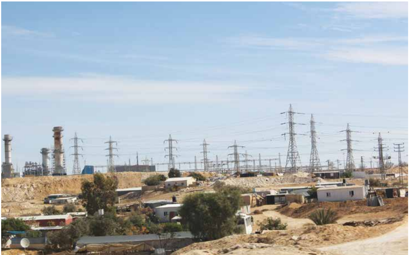
Unrecognized Bedouin village in the Negev

The Mossawa Center aims to promote the economic, social, cultural and political rights of the Palestinian citizens in Israel, and the recognition of this community as a national indigenous minority, with their own national, cultural and historical distinctiveness. The Center develops programs to promote a democratic society, and acts against all forms of discrimination based on race, nationalism, religious affiliation, social status, gender and disabilities.