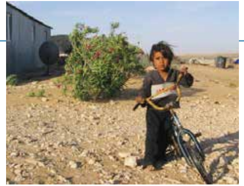
A child at an unrecognized Bedouin village, Negev Desert

This is not only a summary of the law and the prophets in the Bible. We need to look at it today as the basis of the