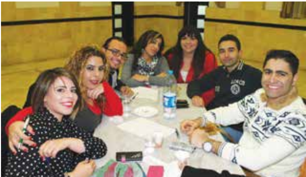
Youth gather for a “Quiz Night” to play a game and raise money for children with cancer.