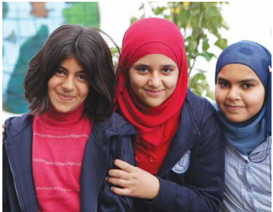
Arab Israeli school children in Um-al-Fahm, Israel

For more examples of Israel’s discriminatory legislation, see Adalah’s Discriminatory Laws Database at http://adalah.org/eng/Israeli-Discriminatory-Law-Database