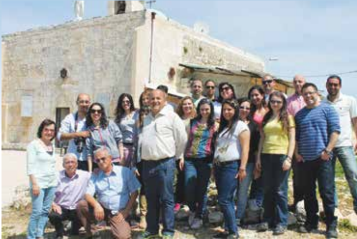
Sabeel youth visit the Melkite church in Ikrith, the only building standing in this village destroyed by the Israeli army in 1951.