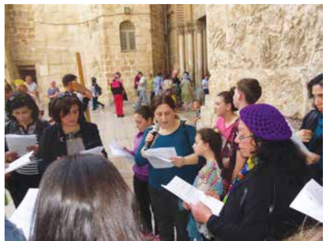
The Sabeel community stops to pray along the Via Dolorosa for the Stations of the Cross during Lent.