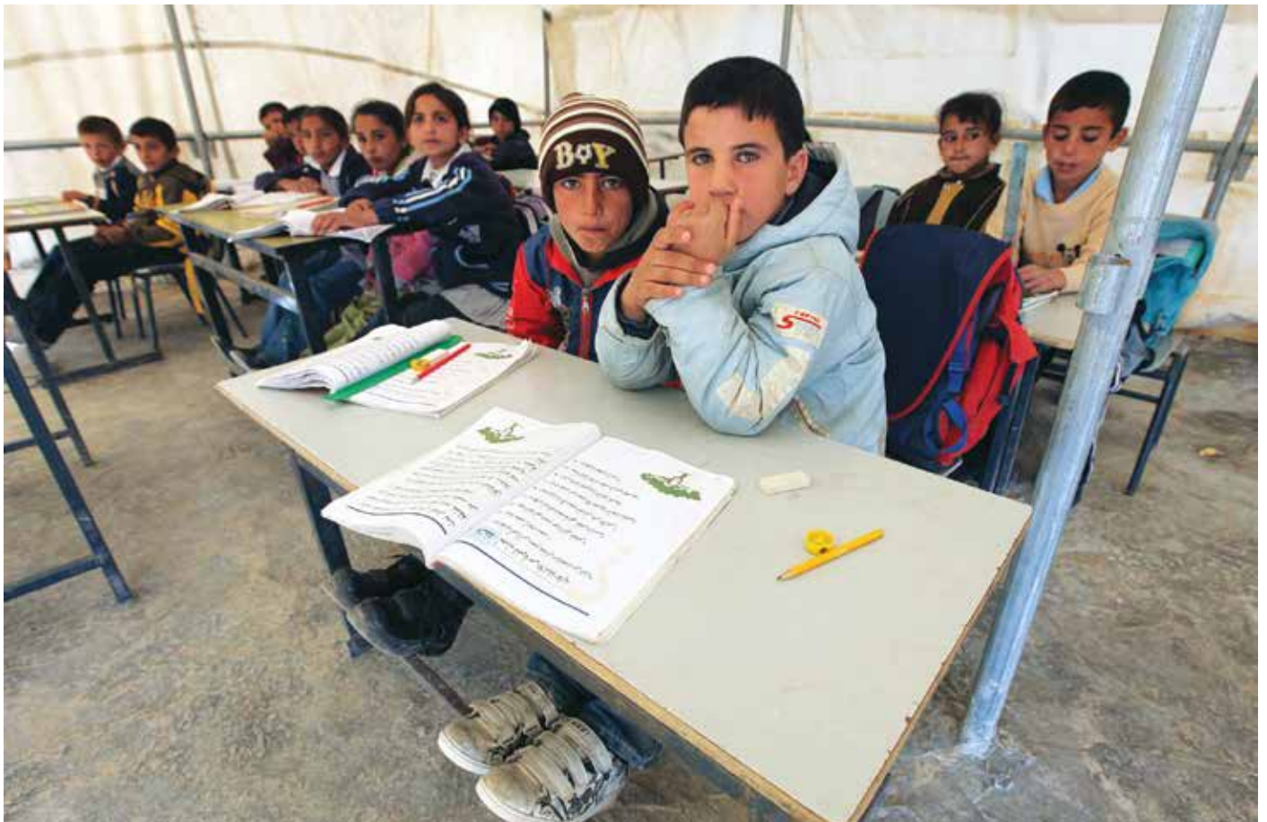
Bedouin school children

The Al-Araqib cemetery incident is just one recent example of the civil and human rights violations that Israel's Arab Bedouin community has been subject to for decades. More than half of the 160,000 Bedouins who reside in the Negev live in villages unrecognized by the state. Not only are these villages considered illegal under Israeli law, but the government refuses to connect them to water, electricity, sewage, telephone lines, or roads, and they face the constant threat of demolition. As a result, residents suffer from a severe lack of education, health, and welfare services.