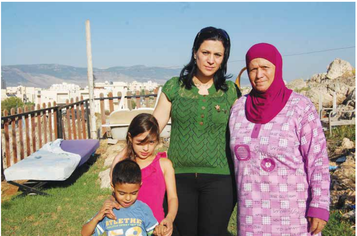
Three generations of a Ramya family struggle to stay on their ancestral land.

Residents of Ramya filed an appeal to this ruling in Israel's Supreme Court (Civil Appeal 7198/13). The appeal has yet to be heard by the Court; however, Judge Barak-Erez has refused to suspend the evacuation orders while the appeal is underway.