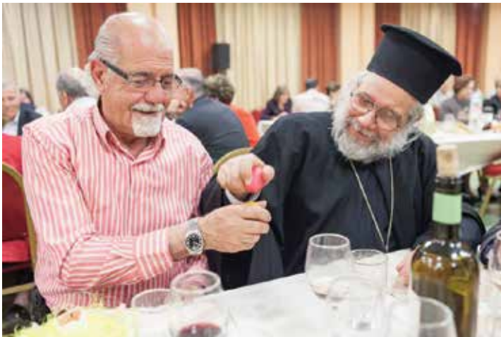
Sabeel's first annual Easter Dinner