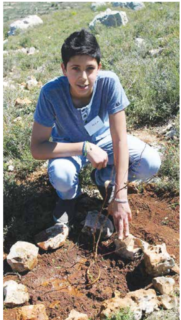
Students from the Terra Santa school plant olive trees at the Tent of Nations near Bethlehem as part of Sabeel's school program.