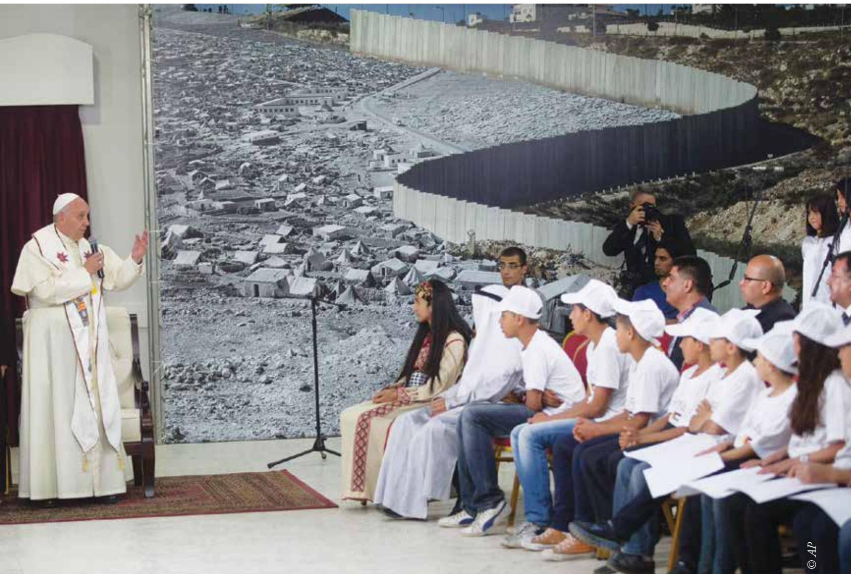
Pope Francis speaks to children of Dheisheh refugee camp during his visit to Bethlehem.