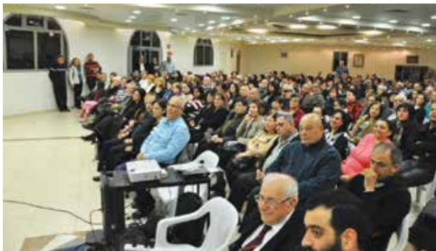
Community members attend the film screening of “The Stones Cry Out” in Haifa.