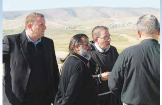
Sabeel’s clergy program visits ancient temple ruins from Abraham’s time as part of a tour of the Negev desert.