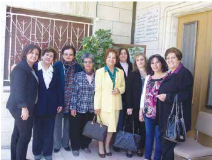
Clergy wives meet at the Melkite church in Beit Sahour for a Bible study and to discuss the importance of ecumenical work.