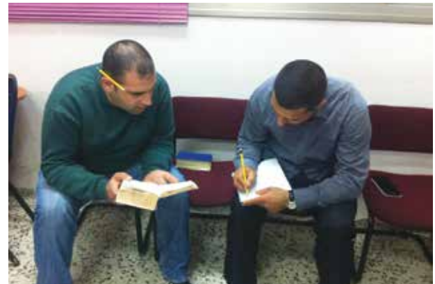
Youth meet in Nazareth for a Lent activity.