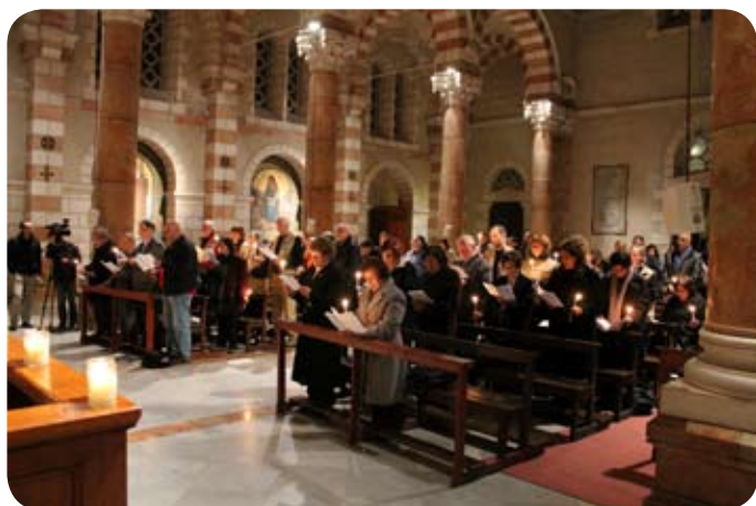
Ecumenical Prayer Service for Syria and Palestinian prisoners at the Dominican Church in Jerusalem