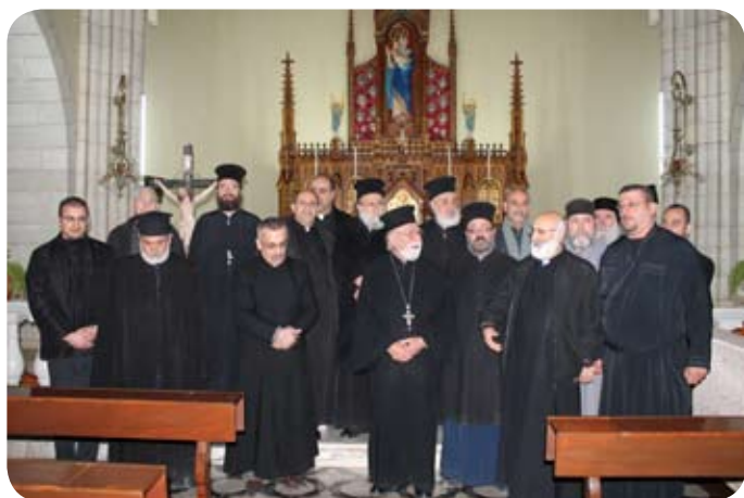
Clergy meeting in Irtas Monastery – Bethlehem