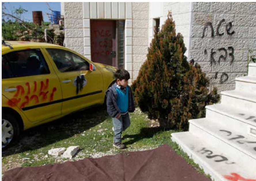
“Death to Arabs” Hebrew graffiti on a Palestinian car in the West Bank

“I was at home doing some house work on Saturday when I heard some