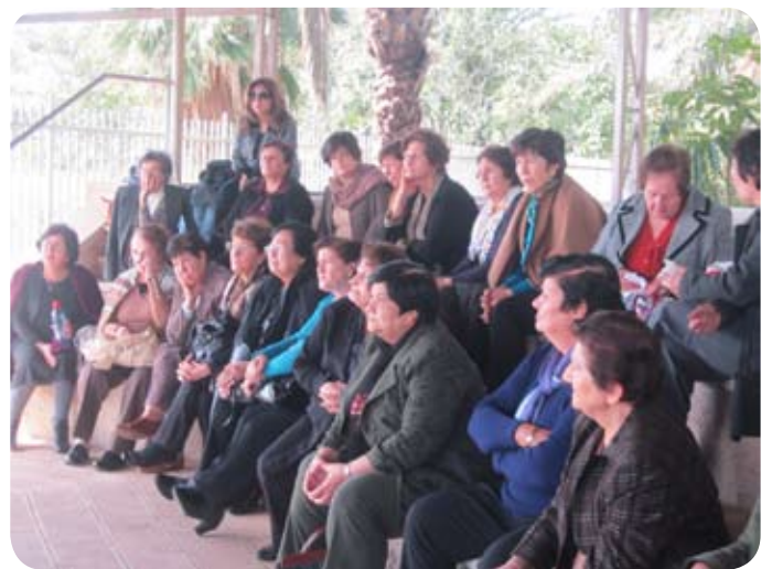
Nazareth women's trip to Tiberius