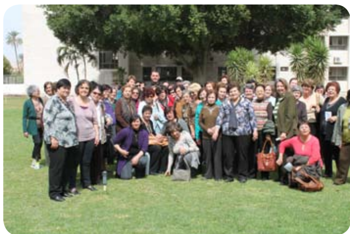
Community Lenten program in Jericho