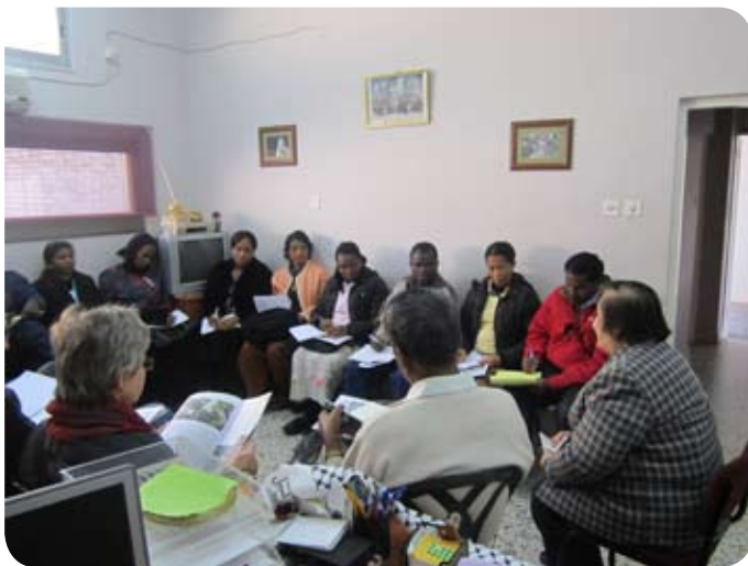
Meeting with a Swedish group