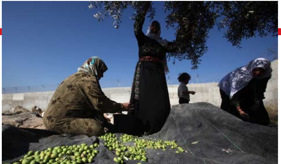
Women harvesting olives by the Wall

Such arguments are acceptable to all those Jews and Christians who believe in a literalist reading of the Bible where every word is divinely inspired and therefore, divinely ordained. They are not willing to apply any critical thinking or utilize the most basic elements of logic or even common sense. For many of us this is an absurd and warped way of dealing with Scripture especially