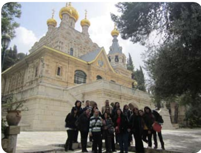
Youth trip to Jerusalem during Lent