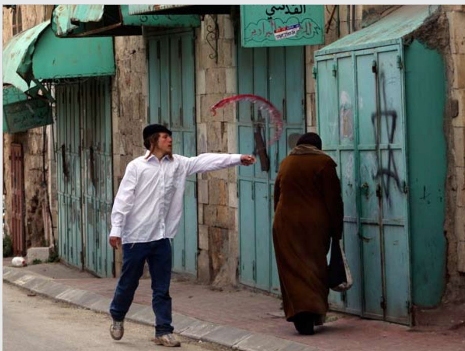
A settler throwing wine on Muslim woman in Hebron

"Miraculously my children escaped and no one was physically hurt, but I am still in shock four days later." I wake up in the middle of the night panicking