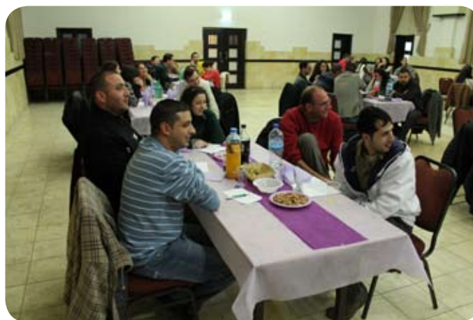
Quiz Night in Ramallah for young adults