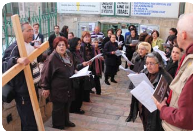
Contemporary Way of the Cross in the Old City – Jerusalem