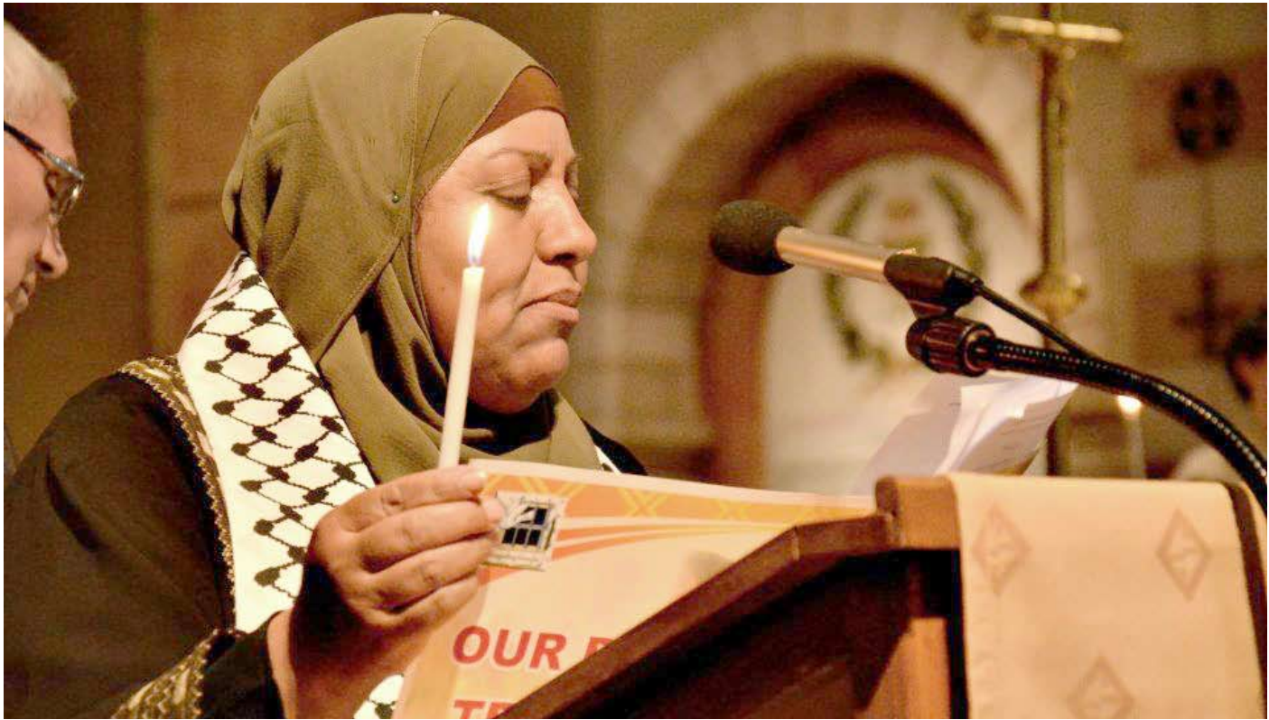
Praying together for Palestinian detainees in the Dominican Church, Jerusalem.