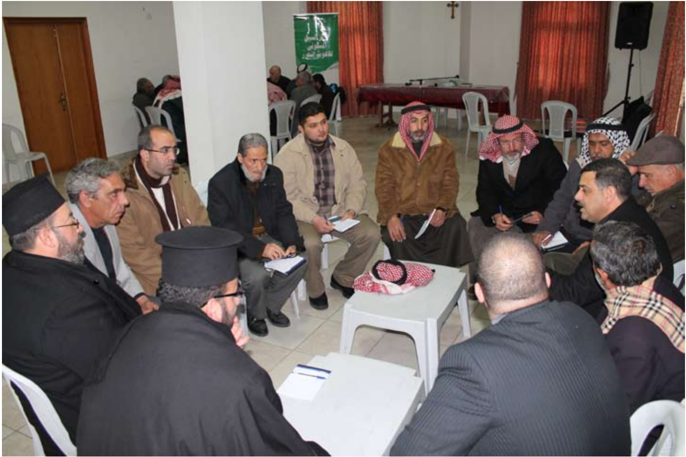
Interfaith workshop in Nablus, West-Bank