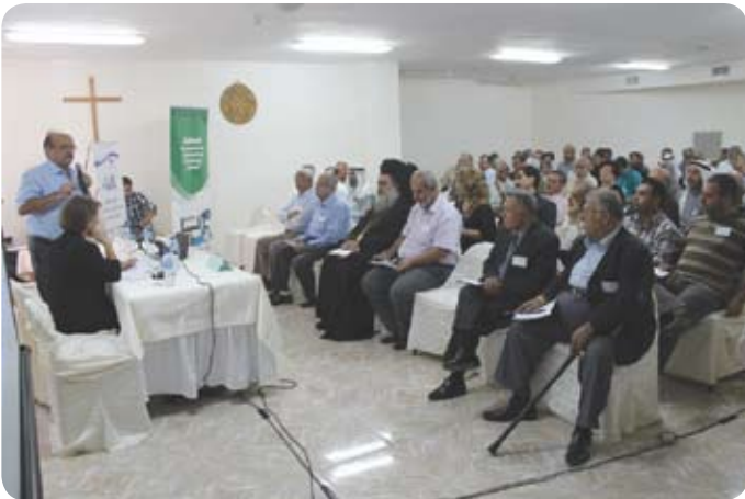
A Conference on the contribution of Educational Curricula to Shared living