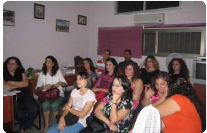
Youth meeting on Racism