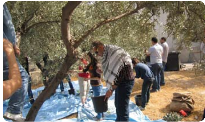
Youth olive picking