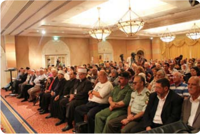
Muslim Christian Conference in Bethlehem: Together Against Racism