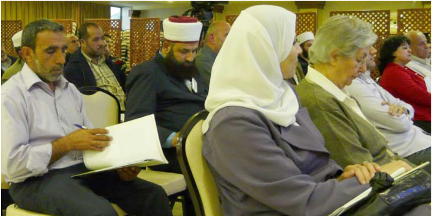
A “Living Together” program in Beit Sahur, West-Bank

The Arabic expression that we use for our interfaith work is “Al’aysh Almushtarak” which literally means “Life Together” or “Living Together.” Before 1948, Christians, Muslims, and Jews used to live together in the same communities. They were all Palestinians. Since the establishment of the state of Israel, Christians and Muslims have continued to live together but, to a large extent, and with the exception of a few mixed cities in Israel, the Jewish people live separately. With the growing religious and political extremism in our country it has been important for Sabeel to have as one of its foci the interfaith work. If we are not vigilant in promoting friendships across religious divides, enhancing greater understanding among people, and strengthening the inner fabric of our society, then we are allowing the extremists to win. Although Sabeel’s financial resources are limited, we are thankful that we have been able to build a solid foundation for our life together,