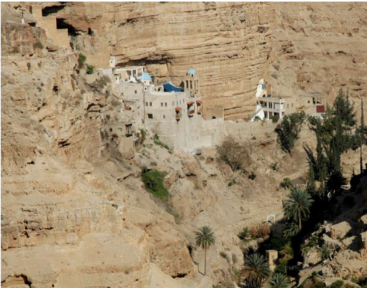
Wadi Qelt Monastery in the Jordan Valley

Christian Dialogue, which is comprised of prominent independent personalities from the different Arab countries, Muslim and Christian alike, and which has taken several initiatives to develop Muslim-Christian relations in the Arab world. In the year 2002, the group published an important document on the issue entitled Dialogue and Coexistence: An Arab Muslim-Christian Covenant , which is, in my opinion, one of the most important texts on this issue and which deserves to be better known and studied. It is presented as a reflection of religious believers, not only as a political perspective, and it has the courage to confront the real problems facing Muslim-Christian relations today in the Arab World.