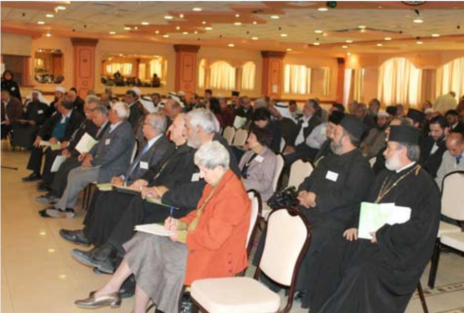
A “Living Together” Conference in Bethlehem

their religious differences might be, live in one society, speak one language, share one culture and experience one socio-political reality. Thus, dialogue with Muslims is a priority for Middle East Christians in a way that is not self-evident in interreligious dialogue in Europe. Dialogue with Jews, in fact, almost always becomes a dialogue within the Middle East context because Muslims cannot be ignored.