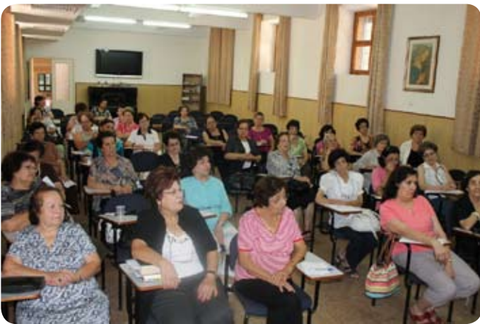
Women’s retreat reflecting on the “Beatitudes”