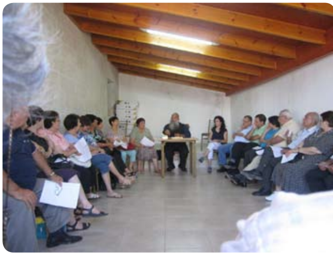
Family Retreat -Taybeh