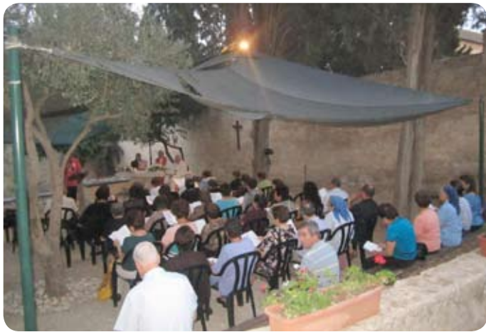
Community program- Prayer Service for the Feast of the Holy Cross