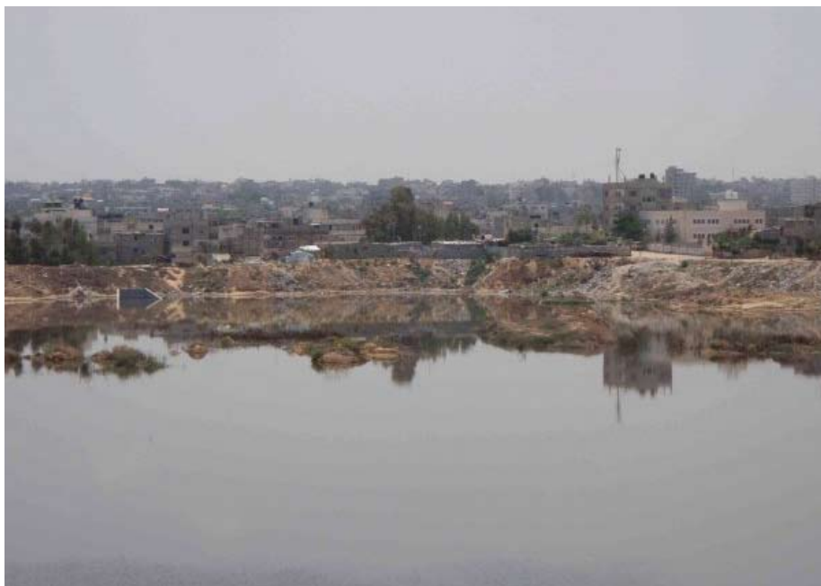
Sewage Lake – Khan Yunis in Gaza

During the next war named “Cast Lead” (December 2008) which lasted more than one month, diesel was in