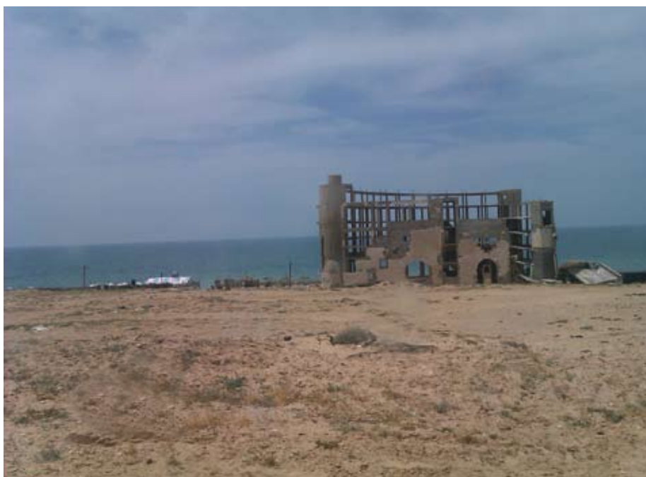
The seashore in Gaza