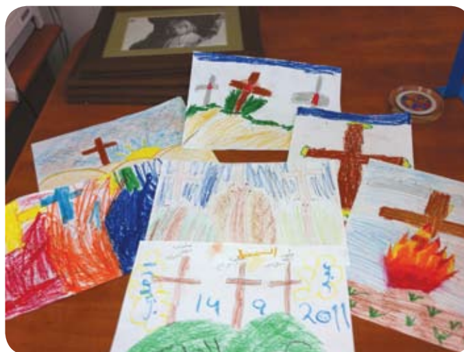
Pictures by the children who are involved in the Nazareth Sabeel Children's program, they made holiday crosses.