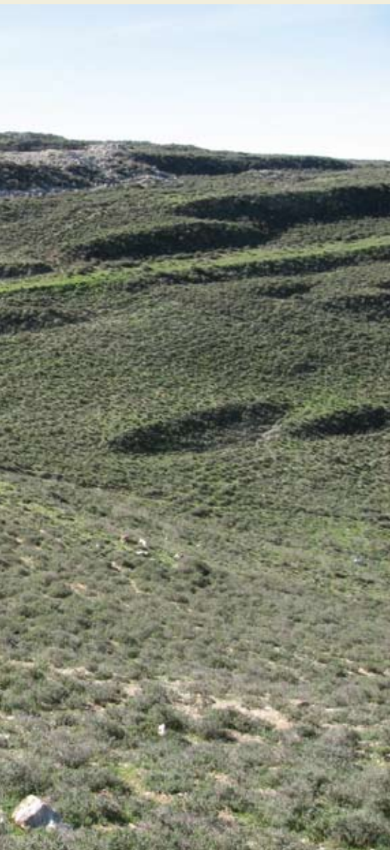
Country side of Sabastiya near Nablus in the spring

interesting? Yes. It reminds me of a woman whose features are imperfect and not classically beautiful, yet there is something so mesmerizing about her face you cannot stop looking.