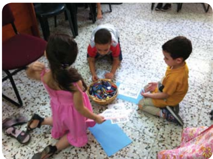
The Nazareth Sabeel Children at their meeting of St. Francis of Assisi.