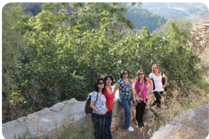
Jerusalem Women's program reaching out to a younger group of women on a hike to Lifta, a 1948 Palestinian depopulated village.