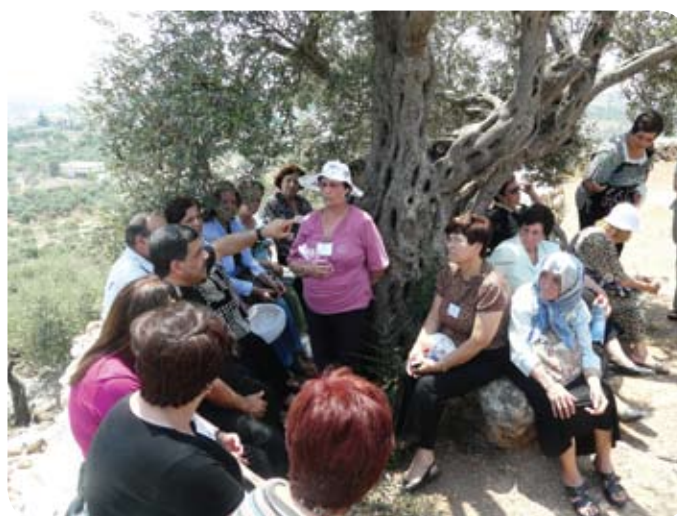
Women around an olive tree in Bir Zeit for a joint Nazareth and Jerusalem Sabeel program.