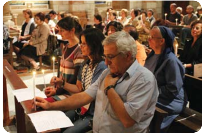
A Sabeel Worship Service for Peace, the local clergy working together in an ecumenical spirit.