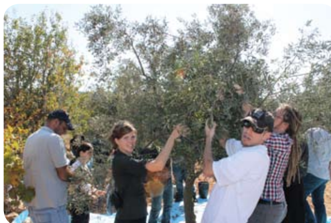
Young Adults picking olives during the harvest.