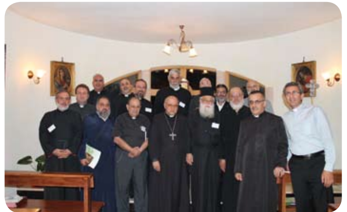
Sixteen clergy from the West Bank, East Jerusalem, and the Galilee area met in Taybe for an Ecumenical Clergy retreat.