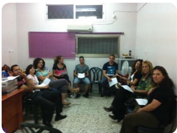
A gathering of young adults in the Nazareth Sabeel program.