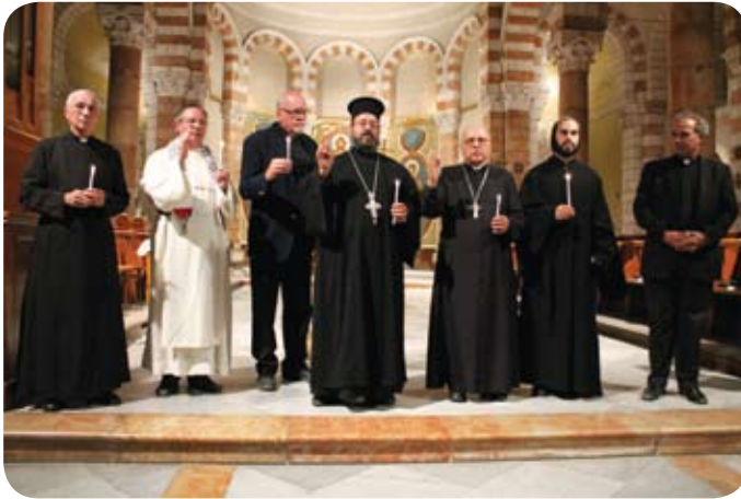
Local Clergy leading the Sabeel Worship Service for Peace in Jerusalem.