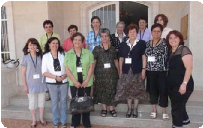
Thirteen clergy spouses met in Taybe for a retreat.