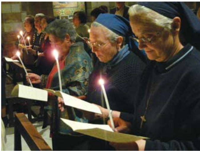
Praying for all those who suffer from violence and remembering those killed in Iraq at an Ecumenical Worship Service in the Dominican Church, Jerusalem.