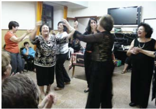
Women dance at a joint Sabeel Jerusalem-Nazareth Community program in Haifa.