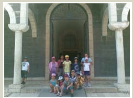
Children from Nazareth on a fieldtrip to Tiberius.