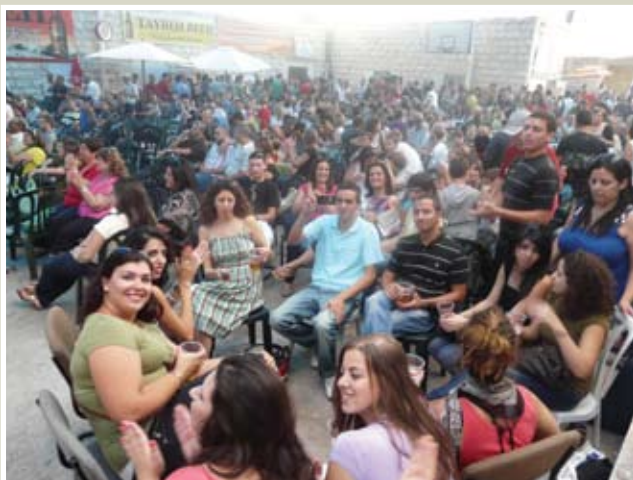
Jerusalem and Nazareth youth enjoy a day together at the Taybeh Oktoberfest.