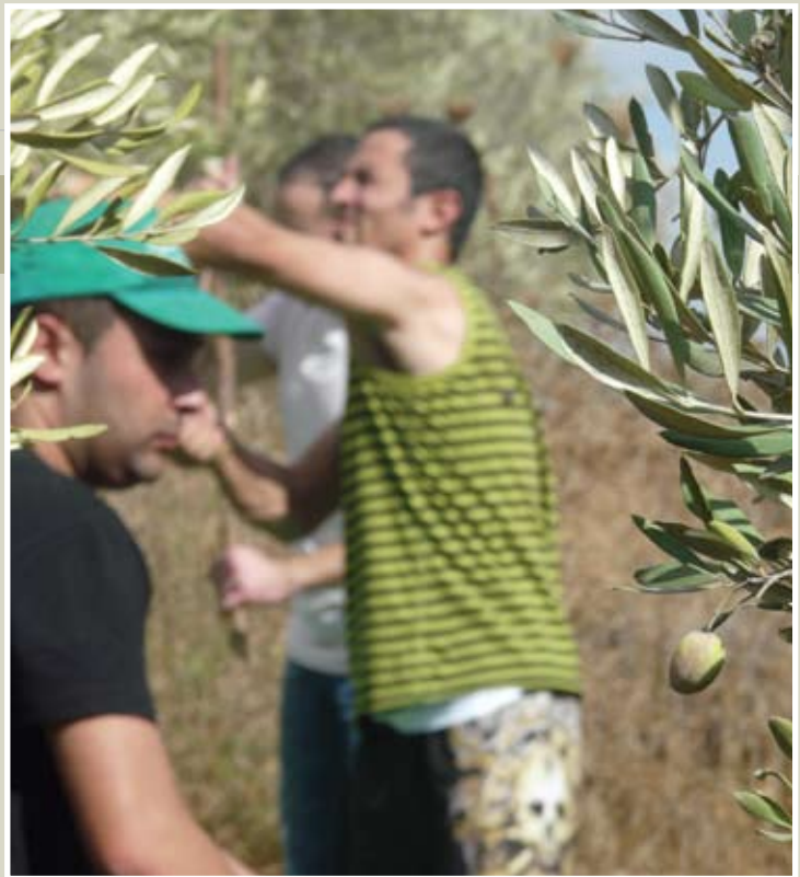
Youth from Nazareth and Jerusalem volunteer picking olives in Sahkneen, a Palestinian village in the Galilee that has been resisting Israeli confiscation of their land.