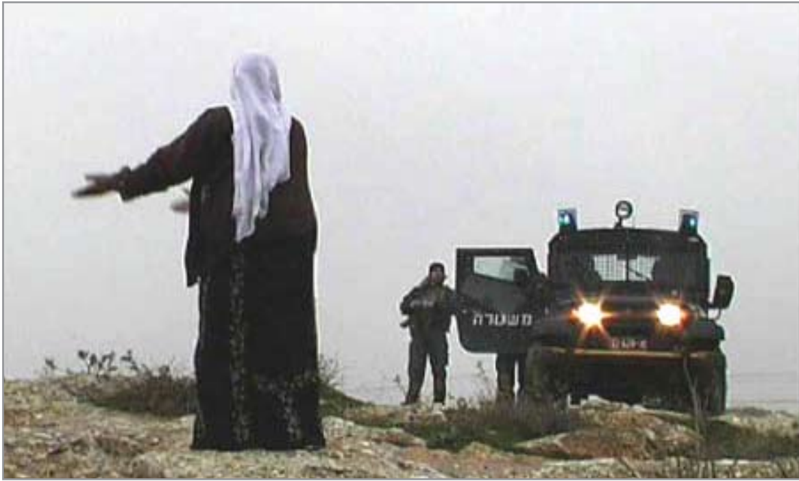
A Palestinian woman in the occupied West Bank challenges Israeli soldiers on her land.