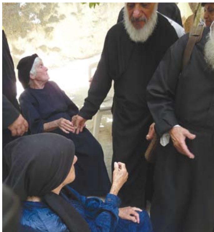
Palestinian clergy visiting communities in the West Bank.

for us); lucky to have as my best teacher an illiterate woman; and lucky to have been raised within the rich Arab culture. These aspects provided me with a worldview unattainable through institutions and professionals. I feel lucky because I had to constantly rethink the meanings of words, because I felt responsible for what needed to be done, and because we had to live with what was locally available to all people. I feel lucky because that combination freed me from delusions that are common among citizens of modern states: having rights but no dignity, information but no understanding, Medicare but no health, acquaintances but no community, technical knowledge but no wisdom, and expectations but no hope. Thank God I had in my home a person who incarnated a world radically different from the world of institutions which is obsessed with competition, control, winning, and progress along a linear path.