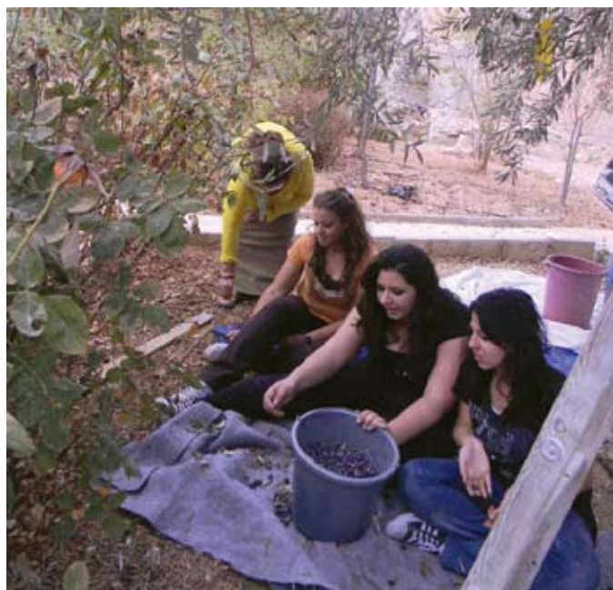
Sabeel youth build community while volunteering picking olives together in Beit Jala.