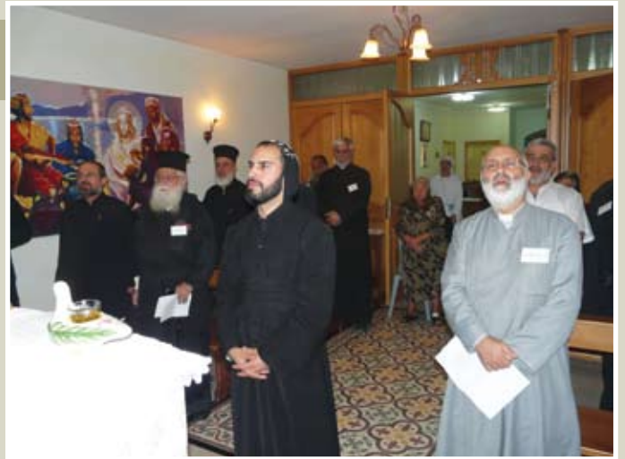
Worshipping together in song at the annual Clergy Retreat in Taybeh.