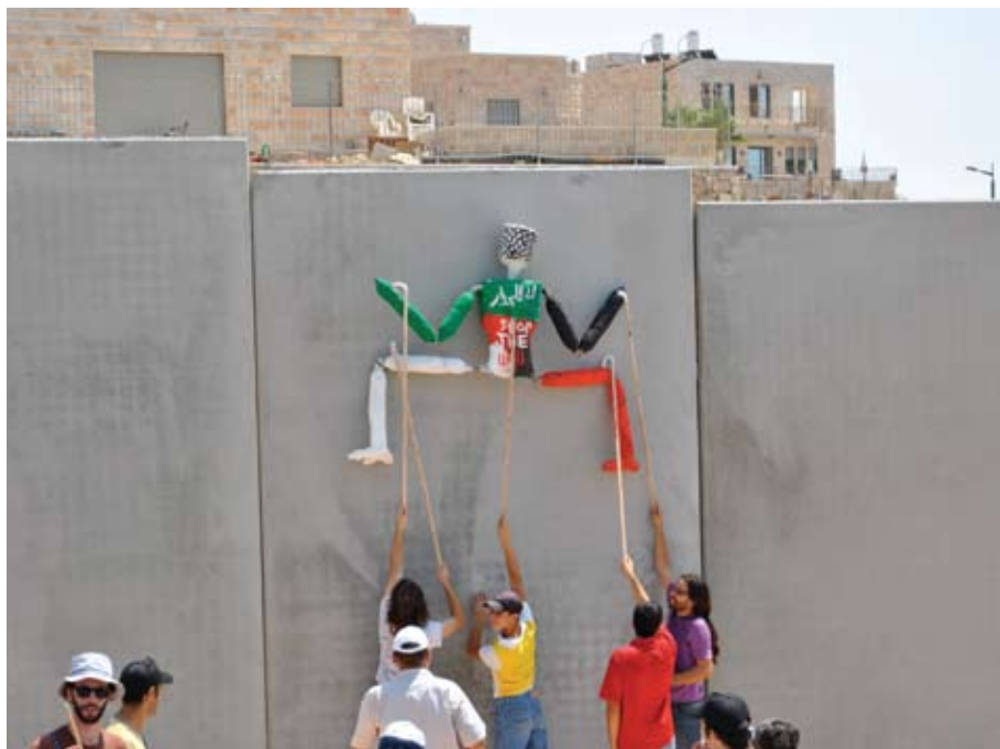
Children maneuver a puppet to climb the separation wall at a protest against its construction around Al-Walaja village.

The Zionist project—well-funded, violent, and supported by superpowers—failed at its stated goals. While its state is militarily and economically strong, it has failed on moral, ethical, and management grounds. The recent demand for non-Jews applying for Israeli citizenship to declare a loyalty oath to a Jewish state is just its latest manifestation. Our struggle is now even more global than that carried out against apartheid in South Africa. Using tools of media, internet, lobbying, BDS,