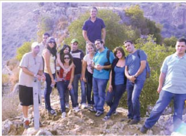
Walking tour of Montfort Castle in the North after the Nazareth and Jerusalem youth volunteered in Sahkneen.