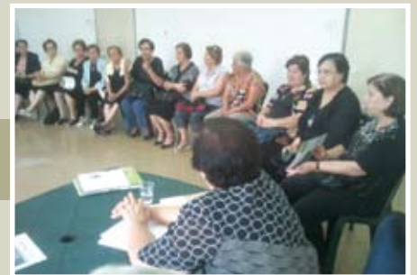
Nazareth women's monthly meeting, currently studying the book "Justice and Only Justice" by Naim Ateek.