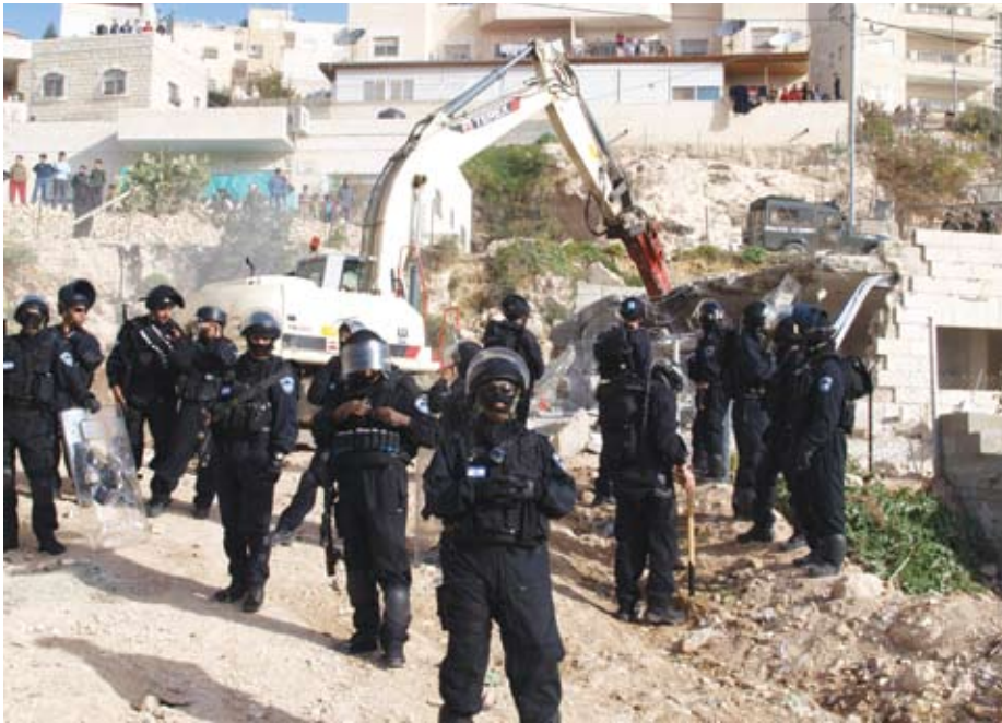
Israeli Police ensure the demolition of a Palestinian home in East Jerusalem. Home demolitions and illegal settlement construction continued throughout 2010.

its victims suffer terribly. In essence such is the nature of ancient as well as modern empires.