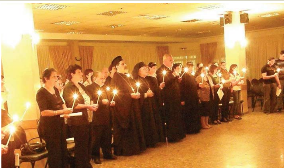
Service in Nazareth for the Christians killed in Iraq.