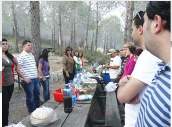
Young adult program: a tour in Sataf, a destroyed village during the Nakba 1948, close to Jerusalem. The young adults held a barbecue in the gardens of the village