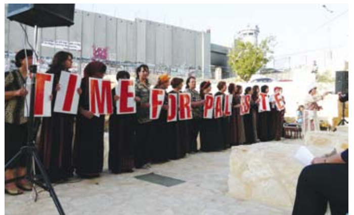
Palestinian women at the Separation Wall in Bethlehem participating in the opening of the World Week of Peace for Palestine and Israel on May 29.