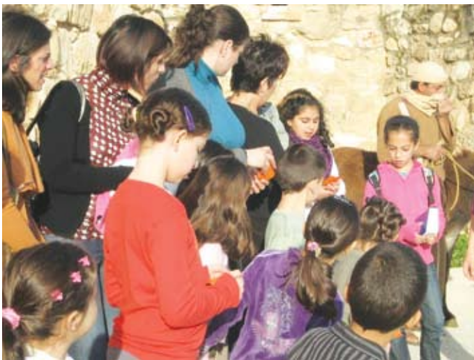
Sabeel kids celebrating Palm Sunday on March 16th 2010 at the “Nazareth Village”.