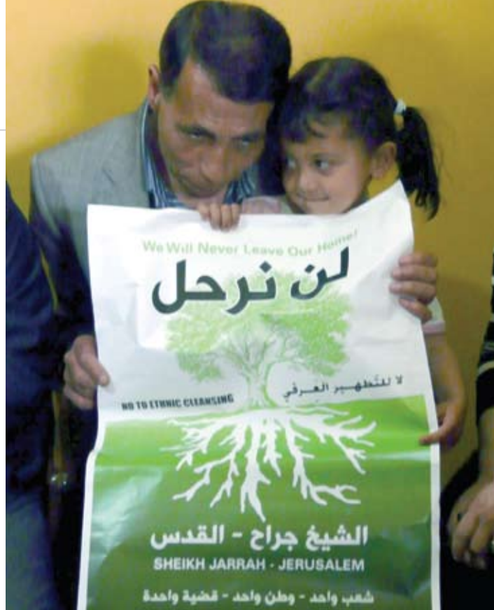
A young Palestinian girl holds a flyer in support of the evicted families of Sheikh Jarrah

I met women from my father-in-law's generation who came of age in 1948 and whose passion for creating a democratic Palestinian state is as strong today as it was 60 years ago. They persevere, hoping that someday their daughters and granddaughters will know true freedom. I met the next generation of women, daughters of the occupation who are building their lives and families around restrictions based solely on their ethnicity -- a life with roads they can't drive on, neighborhoods they can't enter, and places they can't go. And I met the young generation, girls trying to figure out what kind of opportunities await them in a land defined by walls, checkpoints and barriers.