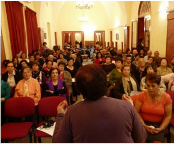
Sabeel women from Jerusalem and Nazareth meeting at St. Margarets Hostel