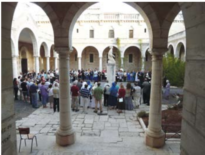
Two hundred local and international Christians gathered at St. Stephens Dominican Church for prayers to break the siege of Gaza.