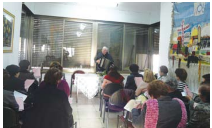
The open Forum on April 27 discussed practical ways of living out “the Kairos Document”