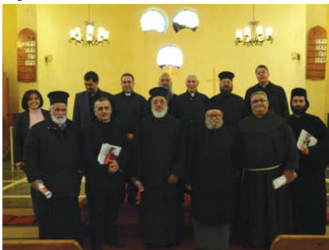
Clergy meeting at the Lutheran Church in Ramallah. Twelve Clergy-men, from different parts of the West Bank met to evaluate the 3rd Clergy Conference and to plan for future “Living Together” programs.