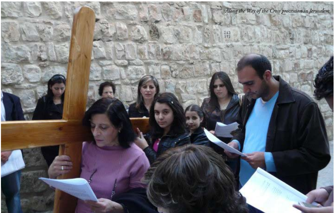
Along the Way of the Cross procession in Jerusalem