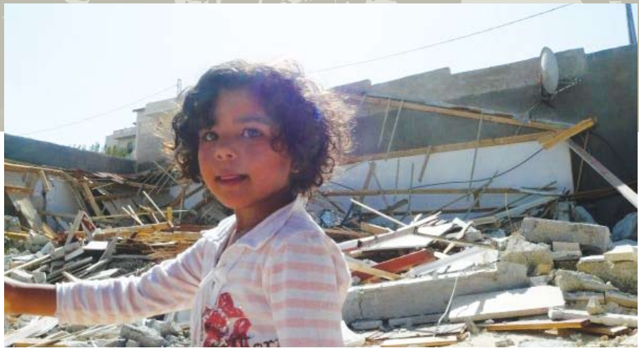
A young Palestinian girl stands in front of her recently demolished home

And then, when the soldiers finally do show up, sometimes immediately, and sometimes months or even years later, the effects are disastrous.