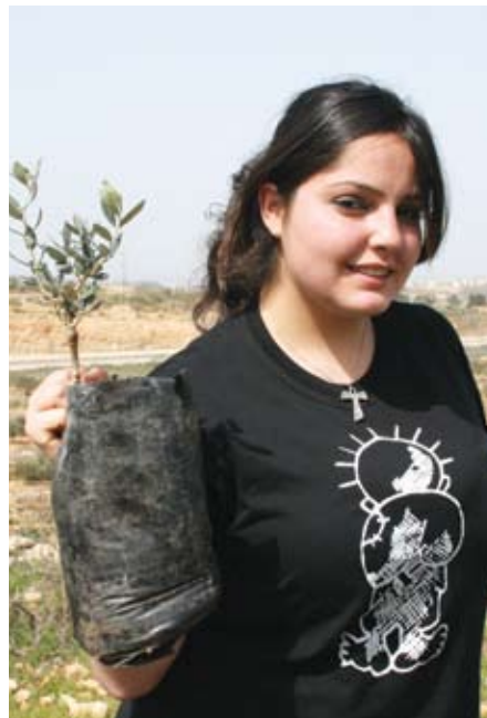
Olive planting project in Hebron

one side, depending on the situation. In the aftermath of 1967, the political agenda of liberation and resistance was the priority, but as time went on, women realized that effective political involvement can not come about without achieving social justice and empowering women with all the tools necessary for confronting the occupation. Women's organizations, therefore, embarked on ambitious programs to attain such a goal by placing emphasis on education, vocational training and campaigns for raising women's awareness. These programs, combined with the political struggle of Palestinian women, earned women leaders recognition throughout Palestinian society. This was clearly reflected in the tremendous support garnered by Sameeha Kahlil when she ran in the first presidential elections against