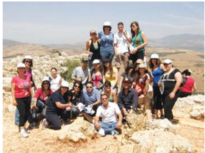
Volunteer work by Sabeel youth from Nazareth and Jerusalem at the Melkite convent in Tiberius.