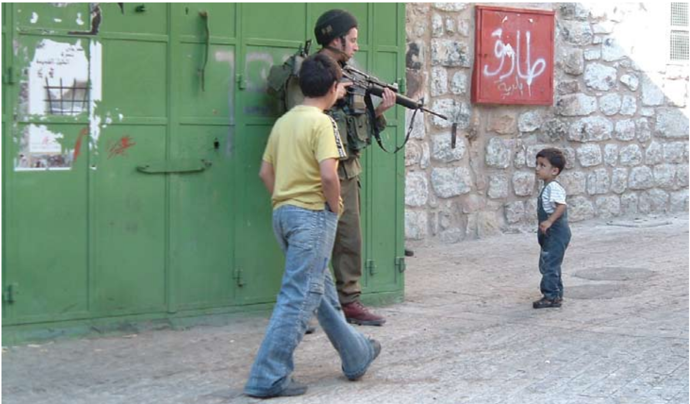
Israeli soldier patrolling in Hebron

of twelve. They can be kept at a police station for up to eight days without any visits from family or friends. In some cases, even a lawyer can be denied access to them. They may, or may not be released on bail.