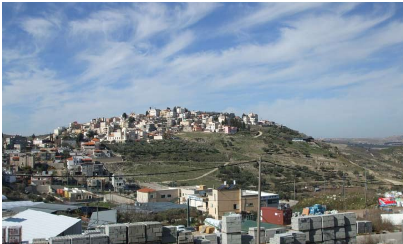
Arab village of Jish in the Upper Galilee