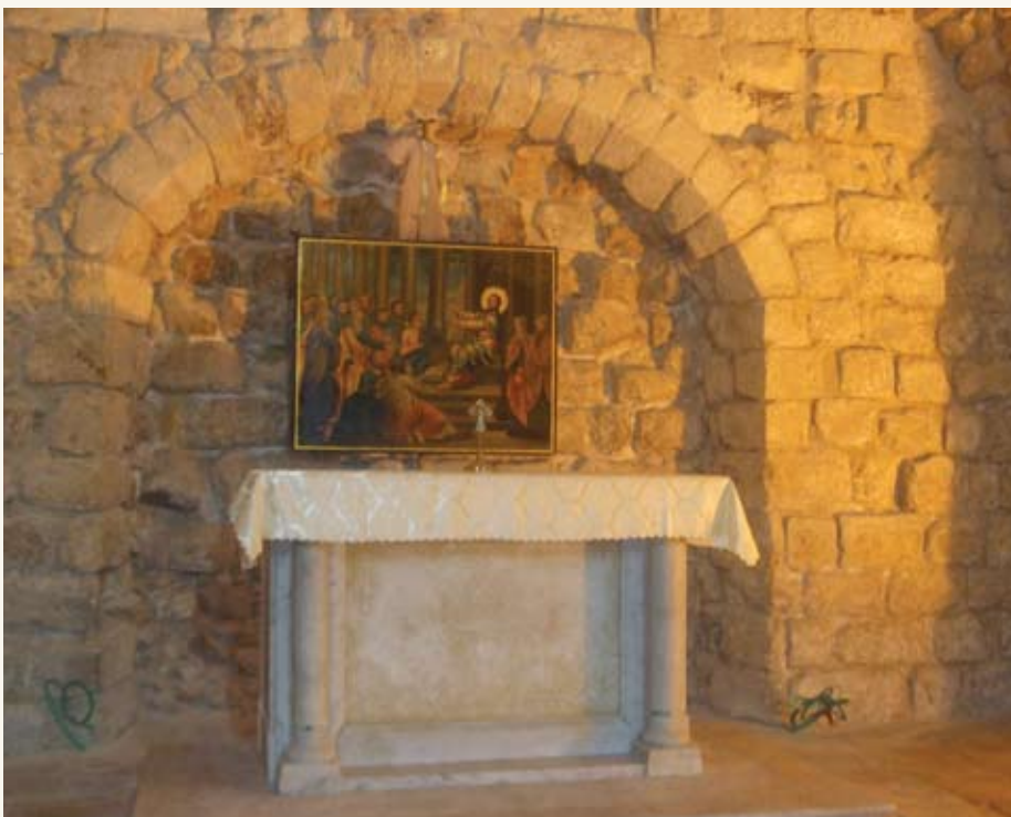
Traditional site of synagogue in Nazareth