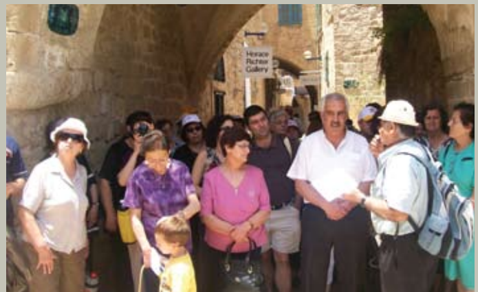
Women's Monthly Meetings Tours and visits to different communities in the north. Joint trip with Sabeel Jerusalem to Akka (Acre) on July 17 th .