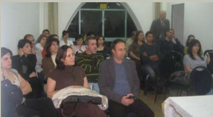
Community Building Sabeel organizes a variety of programs for the local community: holiday programs, performances, worship services, etc. Married Couples meeting about Christian Education for Children