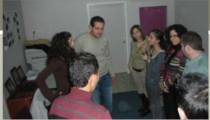
Youth and Young Adult Programs Weekly meetings, bible studies, volunteer work, tours and trips