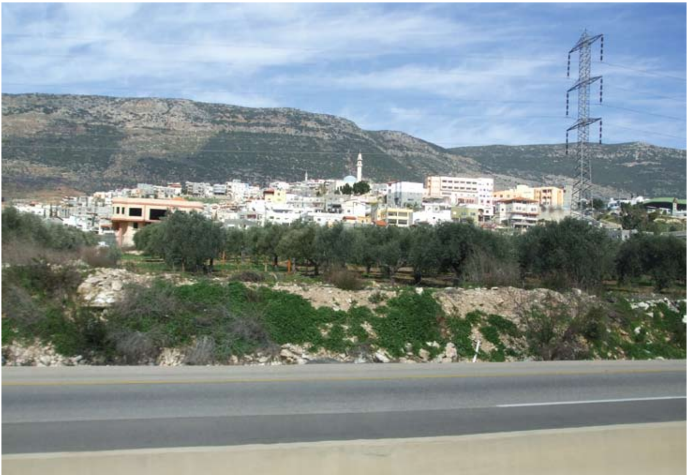
An Arab village in northern Israel

has unanimously approved a resolution saying that the Israeli law violates international human rights law.