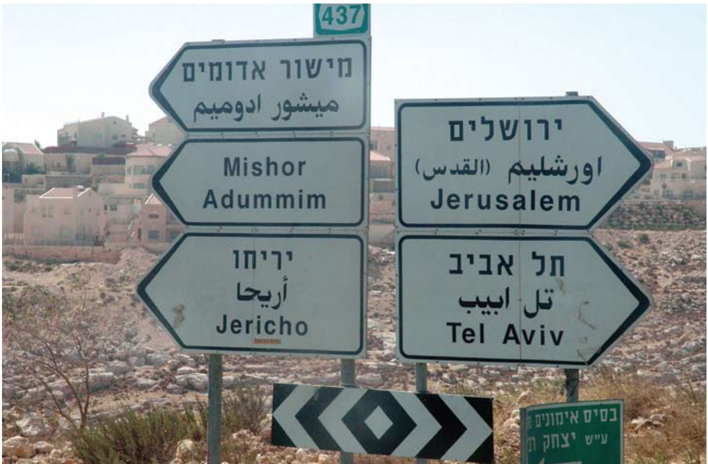
“The ‘Hebraisation of road signs will mean that ‘Jerusalem’ will eventually be replaced in both Arabic and English with the Hebrew transliteration, ‘Yerushalayim’”