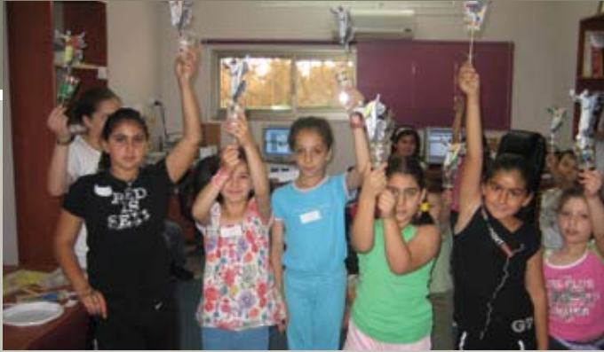
Children's Programs Monthly meetings, Ascension Day, May 23, 2009. Handicrafts by the children