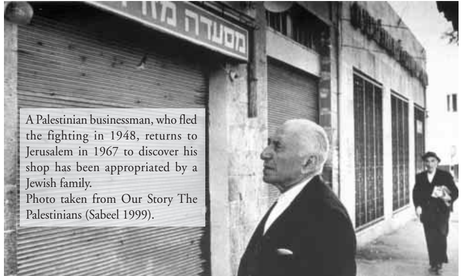
A Palestinian businessman, who fled the fighting in 1948, returns to Jerusalem in 1967 to discover his shop has been appropriated by a Jewish family.

Adding insult to injury, he went on to praise Israel’s welcoming of immigrants from around the world to populate the newly created State of Israel. It meant absolutely nothing to President Bush that the indigenous Palestinian population, lingering for 60 years only hours away from where he was standing while