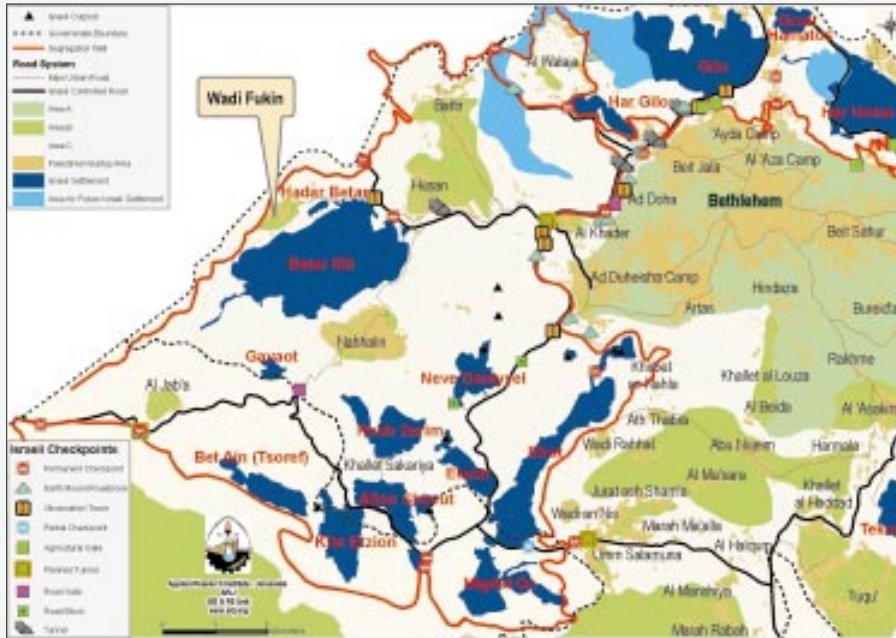
Map 3: The Israeli Segregation Wall affecting Wadi Foqin

example of the potential threat to the West Bank Aquifer System.