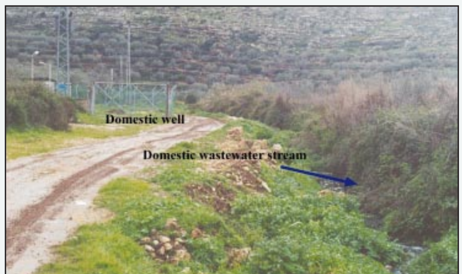
Figure 1: Wastewater Stream Flowing from Ariel Settlement to Palestinian Agricultural Lands in the Salfit area

The fragile Palestinian environment has been exposed to pressures ensuing from the practices of the Palestinian population and from the practices of the Israeli settlements. Israeli colonization policies have added to population pressure as settlements continue to grow in the Occupied West Bank. Currently, more than 207 Israeli settlements are scattered all over the West Bank, including East Jerusalem. These settlements accommodate more than 480,000 Israeli settlers. Israeli settlements are reported to release