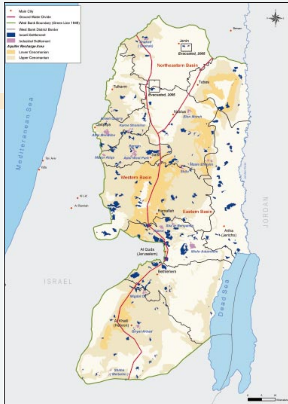
Map 1: Recharge Areas of the West Bank Aquifer System

With respect to solid waste, around 80% of the solid waste generated by settlers living in the West Bank is dumped in sites throughout the Occupied West Bank (ARIJ, 2005). This figure does not include the significant quantity of solid waste, much of it hazardous, produced in Israeli industrial areas inside the West Bank. These pollution sources are causing visual distortion of the landscape and decreasing the aesthetic value of the natural environment as well as causing health problems.