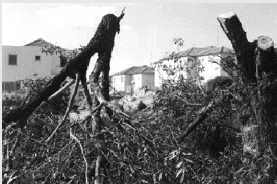
Olive trees uprooted by settlers from Revava during the olive harvest, November 2000.