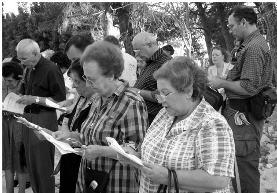
Praying at the Wall

A Visit to Tur'an: On July 17 Sabeel welcomed over 100 people from Tur'an to