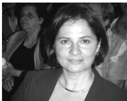
Minister of State for Jerusalem Affairs, Hind Khoury

Mixed Marriages: This topic became a priority for Sabeel as a series of local events created mixed feelings about the whole issue of Muslim/Christian relations in Jerusalem, Ramallah and Bethlehem.