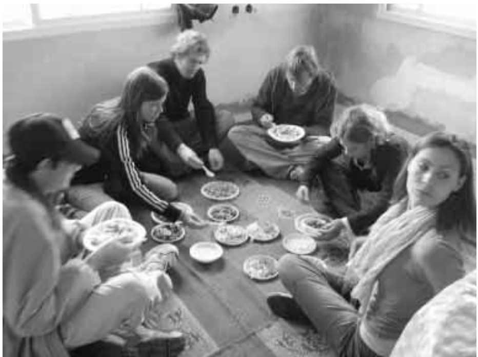
Sharing a meal in Hebron

There certainly is an atmosphere of hope in the increasing number of delegations and groups who have visited Sabeel in the past two months. Students from theological seminaries, a CPT delegation, Mennonite Advocacy leaders, EAPPI activists, Amos Trust group, The Church of Scotland, The National Council of Churches in Christ, International YMCA-YWCA youth leaders, and French Catholics who are interested in beginning an IFOS chapter in France, all shared their interests and looked for ways to show their solidarity.