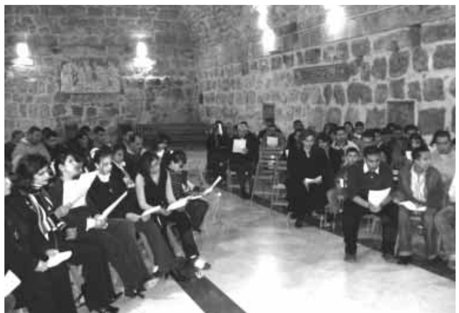
Ecumenical youth service -Bethlehem

On January 4, halfway between Western and Eastern Christmas, 68 young people enjoyed the first Youth Christmas Dinner held at YWCA. A local group, Raja' (Arabic for "hope") entertained with hymns