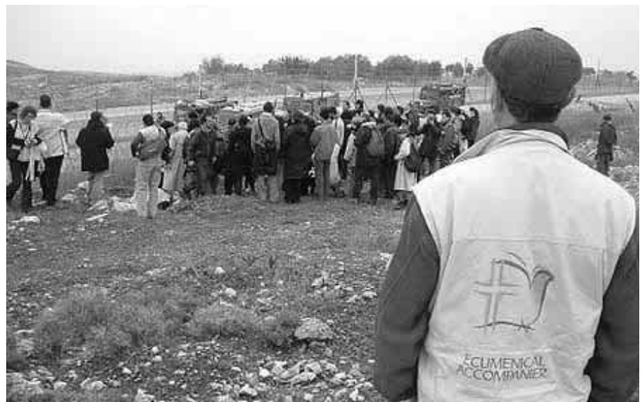
Ecumenical Accompaniment Program in Palestine and Israel (EAPPI)

In our "Ecumenical House" we've had visitors nearly every day. One night it might be a group of men telling us that their sheep were wandering around loose on the other side of the fence because the shepherd had been arrested. Another day it would be a 16-year old boy who had been beaten by a soldier. One night we witnessed two boys getting shot in their leg and arm next to the gate. There were the women who came and asked what they should do not to get pregnant again. There were the women and men who wanted to learn English. There were the sweet neighbor girls who just wanted to talk or play. Could we help them in some way? Sometimes yes, other times no.