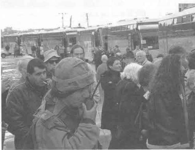
Assembly participants, prevented from passing through a checkpoint outside Ramallah, wait as an Israeli soldier tries to figure out what to do. Eventually, they were allowed to enter Ramallah.

As I held in my left hand a piece of stone from one of many demolished Palestinian houses, and in my right hand, a piece of bread (food for the journey), at the closing service of the Sabeel Alternative