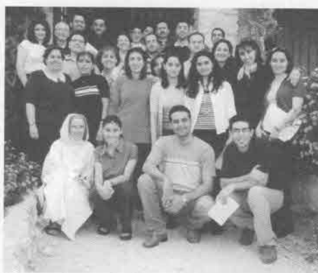
The youth spend a day in Beit Jmal.