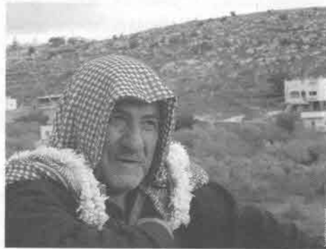
A Palestinian villager near Bethlehem.

Palestinians are being taught the "lesson" of opposing Israeli power and standing up for their rights and dignity, if the message from the Israeli government to the Palestinian people is surrender or die--a message not unfamiliar to Jews--do we repeat this story at the Passover table?