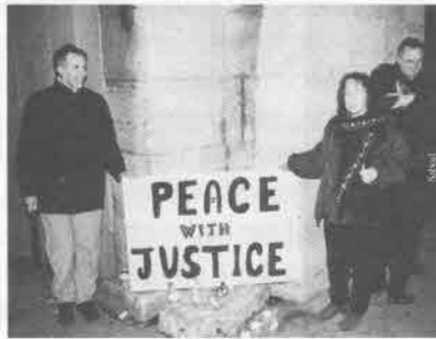
Participants from the Alternative Assembly hold a candlelight vigil outside Jerusalem's Old City.

Sabeel is an ecumenical Christian center for Palestinian liberation theology, which seeks to make the Gospel contextually relevant. Sabeel, which in Arabic means both "the way" and "spring of