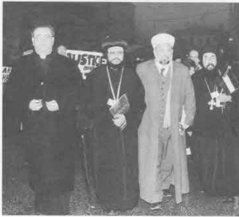
Christian and Muslim leaders head a solidarity rally in Ramallah during the Alternative Assembly.

support for the state violence Israel has undertaken against the Palestinian people. In the words of Pogo, a comic strip from my childhood, "I have met the enemy, and it is us."