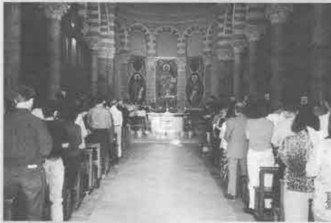
The day of fasting ends with prayer at St. Stephen's Dominican Church.