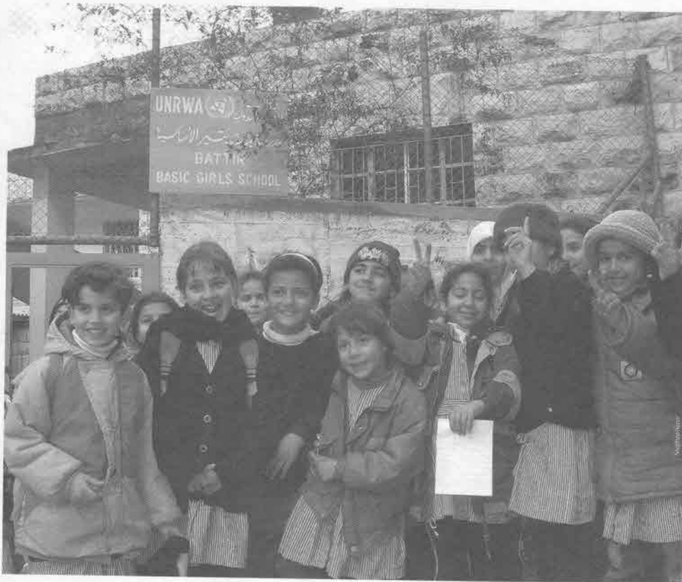
A group of Palestinian refugees gather outside their school in Battir village (near Bethlehem).

Friends of Peace and Justice in the Holy Land, Inc. P.O. Box 4214 Ann Arbor, MI 48106 USA