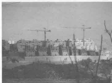
Israel continues construction on Har Homa settlement, which is being built on land owned by Palestinians from Bethlehem, Beit Sahour, Um Tuba, and Sur Baher.

The first issue we have to examine is that of the generous territorial offer. It was