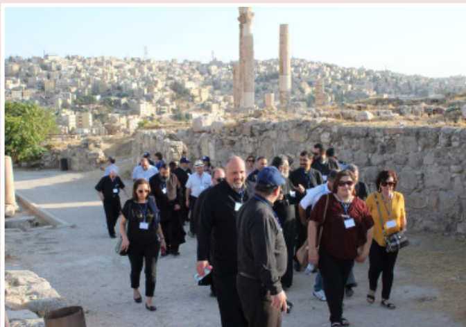
Clergy retreat tour to Amman Citadel