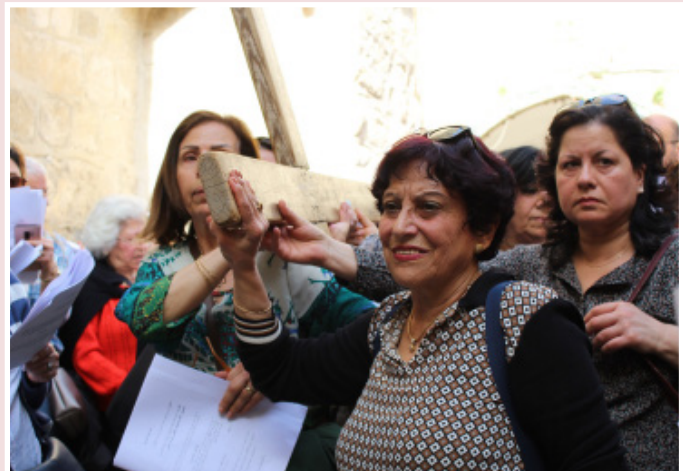
Carrying the Cross during the local Sabeel Way of the Cross in Jerusalem