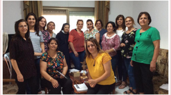
Roman Catholic Bible Study Group, Zababdeh