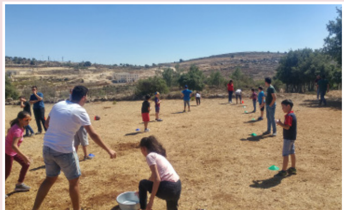
Meeting for the youth of the different Bible Study groups at the Tent of Nations.