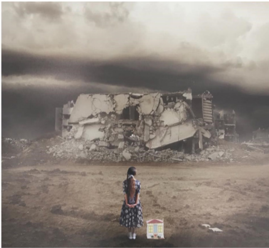
"Perhaps the most beautiful memories are those of a place." - Mahmoud al-Kurd