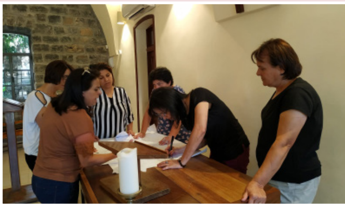
Training retreat in Tiberias for local Bible Study facilitators

Today, Sabeel supports over 28 contextual Bible study groups spread out across the West Bank (8 of these groups added in 2019). The groups are formed of youth, young adults, and women. The groups meet on a weekly basis, to read the Bible and explore what it means to be a Christian living in the land of our Holy One.