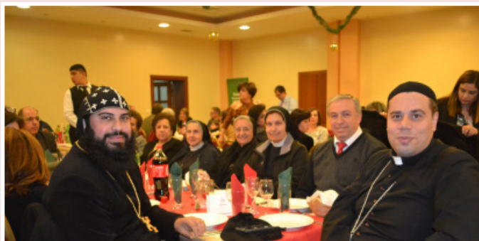
Ecumenical Christmas Dinner

In 2019, as part of the ongoing work on the Palestinian Curriculum. Sabeel made over 40 recommendations to the Palestinian Authority Ministry of Education which would make the curriculum more inclusive and make how 'the other' is viewed more positive. a number of these recommendations have been made in the new curriculum books.