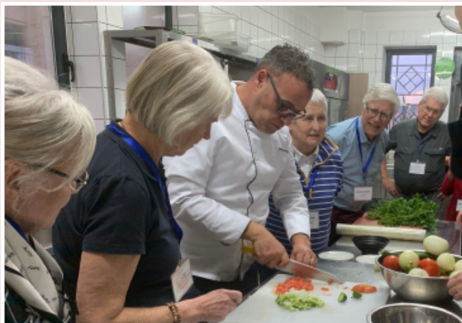
Sabeel 1st International Gathering Activities at the Tent of Nations and Dar al Kalima University College of the Arts.