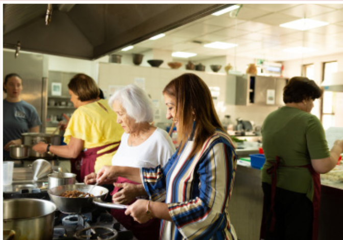
Reviving indigenous Palestinian food and theology