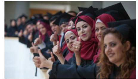
Students at Dar al Kalima

Whatever we preach has to be translated into action, and this is what we do in this university. Here, Christians and Muslims work together through art. It creates new solidarities and a new vision of what it means to live together. Art creates the common ground in which Christians, Muslims, and others can come together and develop their skills.