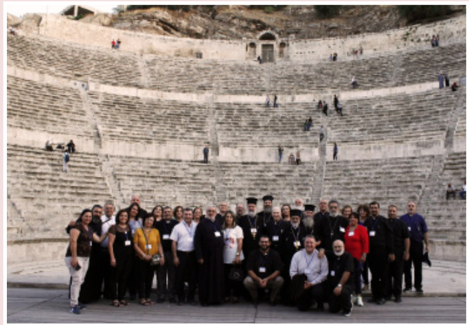
The clergy retreat in Jordan