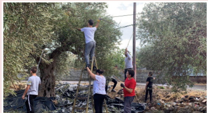
Olive picking with Sabeel Nazareth

An initiative of over 100 Palestinian, Israeli, and international organisations, giving people the opportunity to rise up in support of Palestinians through simple, non-violent actions on a weekly basis. In 2019, Sabeel began work on a new version of Kumi Now which will bring more organisations together through the areas in which they work. For more information see www.kuminow.com .