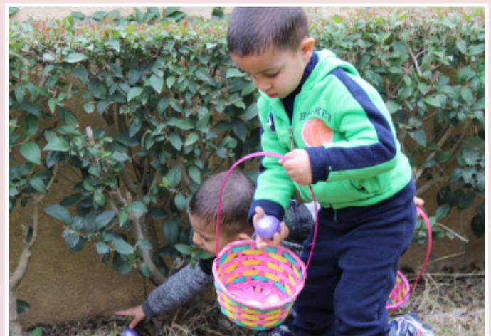
2019 Easter Egg Hunt for 100 children from Bethlehem and Jerusalem